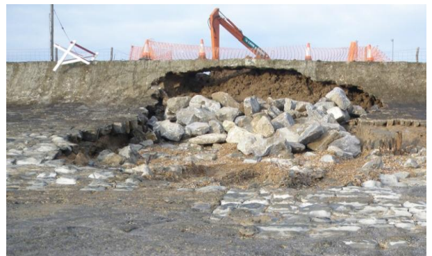
Emergency repairs to defences at Hythe Ranges

Some elements of the project cannot be influenced, such as Government funding and our legal obligations. However, there are aspects such as construction materials, amenity use and visual appearance that local communities may be able to help shape.