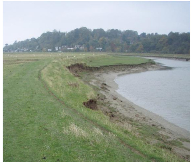
Flood bank erosion on the tidal River Rother

Due to the complexity and scale of the projects, this work will take approximately 3 years. Once these are complete, we will then move to the design and construction phase, and seek planning permission for the Lydd Ranges and Rother Tidal Walls East schemes.