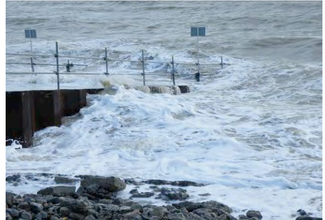
The partially completed works held up well during the recent storms

The partially constructed works have held up extremely well against the recent storms, with only limited damage/losses.