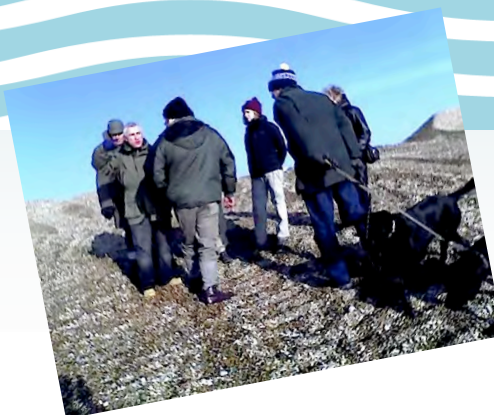
DOC Committee Members during a site inspection at the Lydd Ranges with staff from the EA and MOD- Dec.08